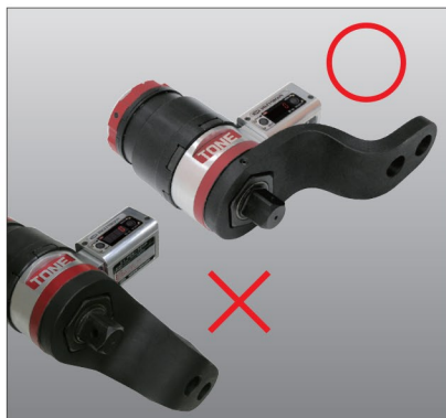
Reaction plates must be placed parallel to the display to protect display from damage.