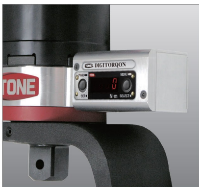
Red LED for better readability outdoors and at night.