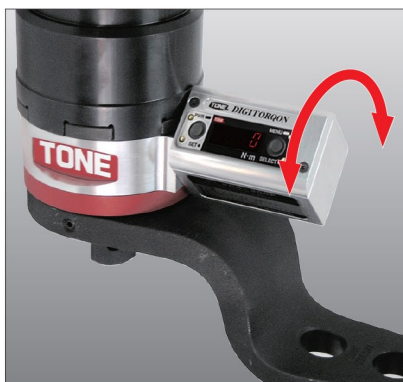
Swivel LED Display for easy monitoring.