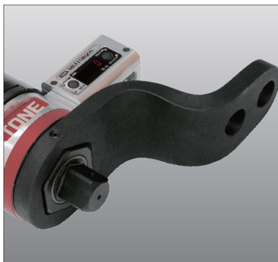
Straight and Offset-type reaction plates are included as standard accessories. Custom made reaction plates are also available.