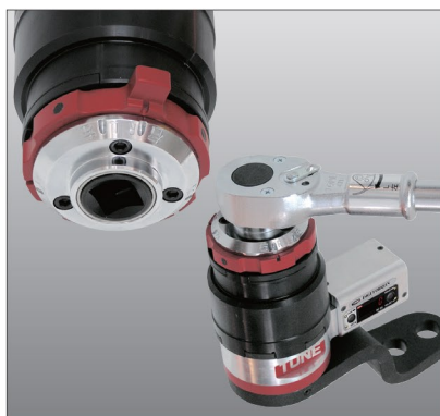
Combined of Anti-Wind-Up clutch and ratchet handle improves workability and protects operator from spring back force of the gears.